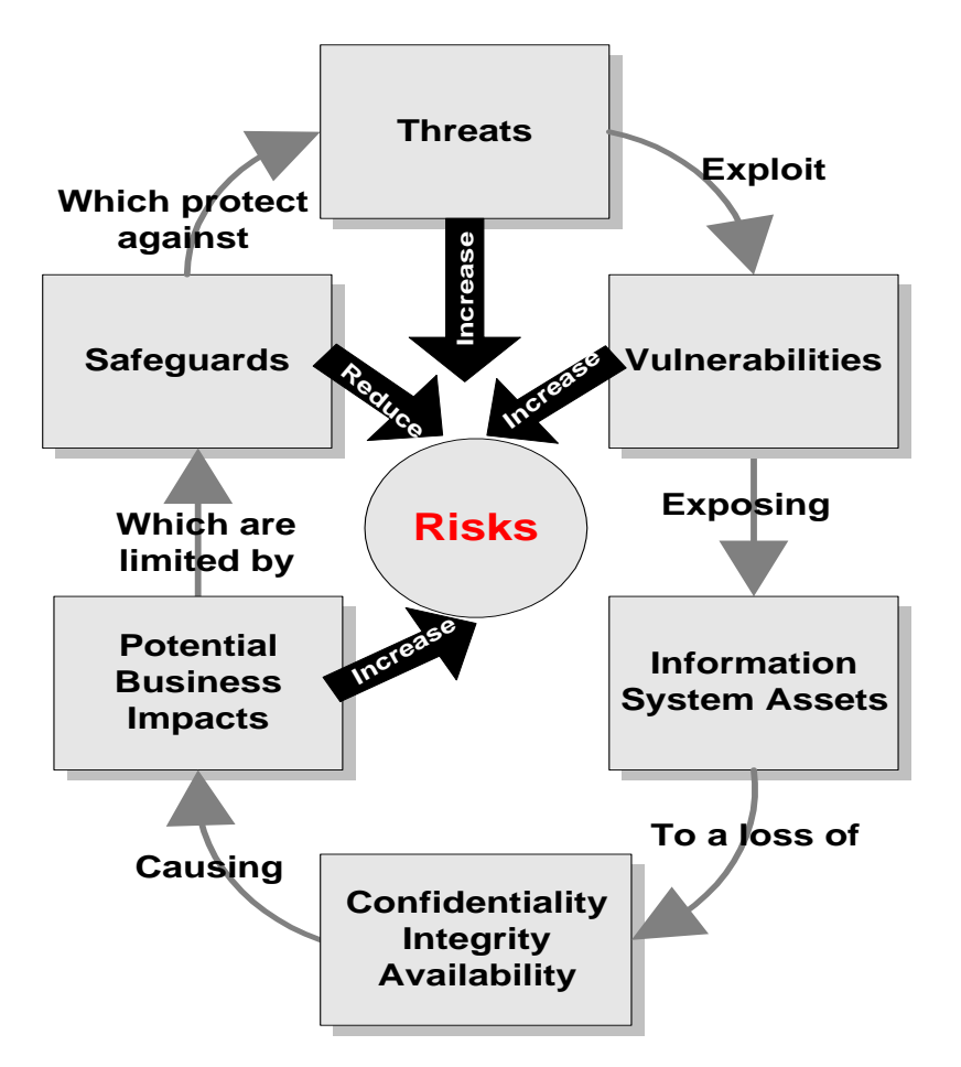
10.17 An example of the output of risk analysis is depicted as follows: