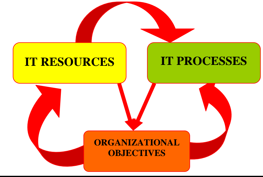
IT Audit Manual Volume I

Thus, IT Audit is all about examining whether the IT processes and IT Resources combine together to fulfill the intended objectives of the organization to ensure Effectiveness, Efficiency and Economy in its operations while complying with the extant rules. This can be depicted diagrammatically as follows: